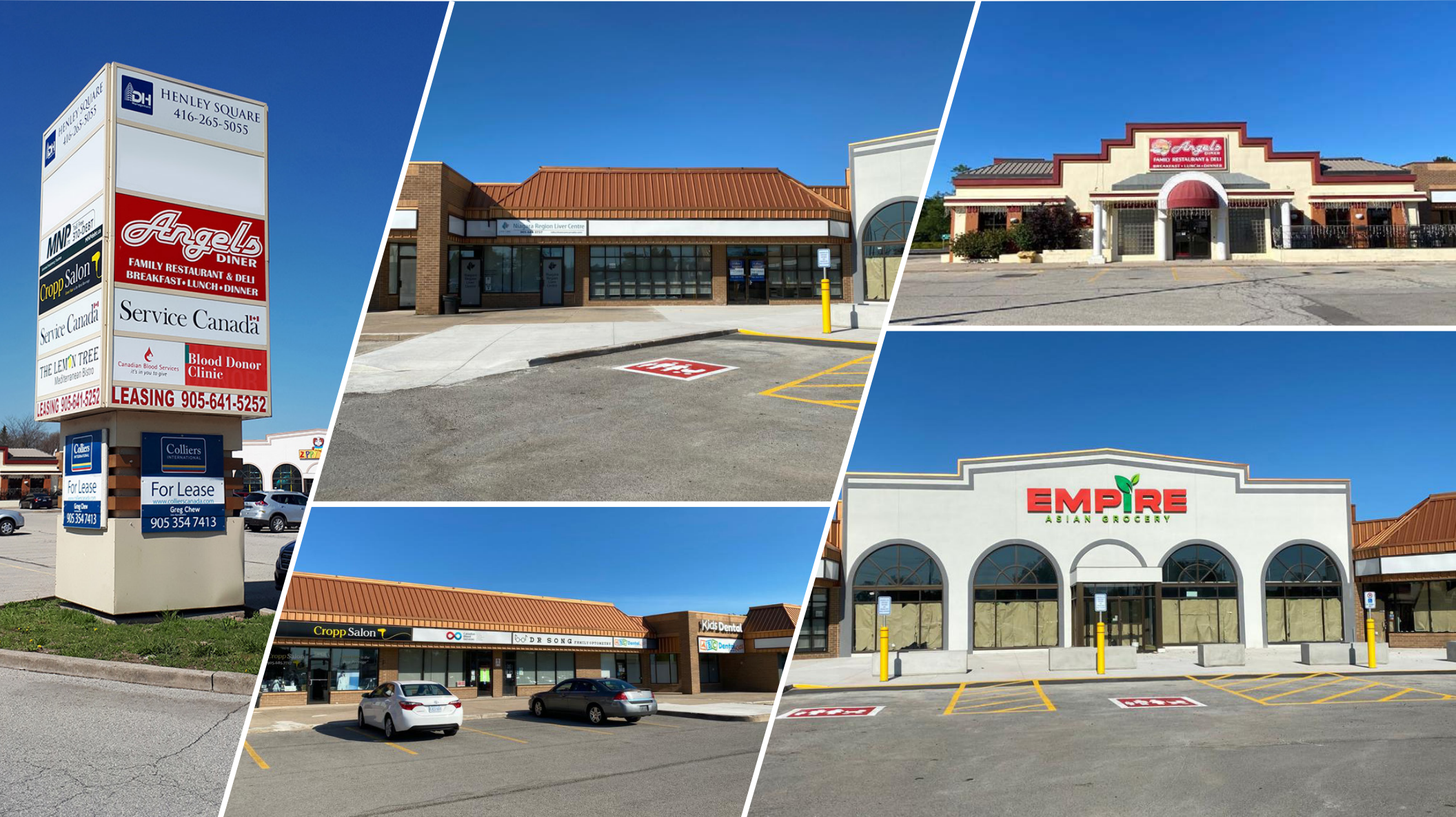
CLOCKWISE FROM TOP LEFT: Pylon Sign // Unit 13 // Angel's // Empire Grocery // North Plaza Strip