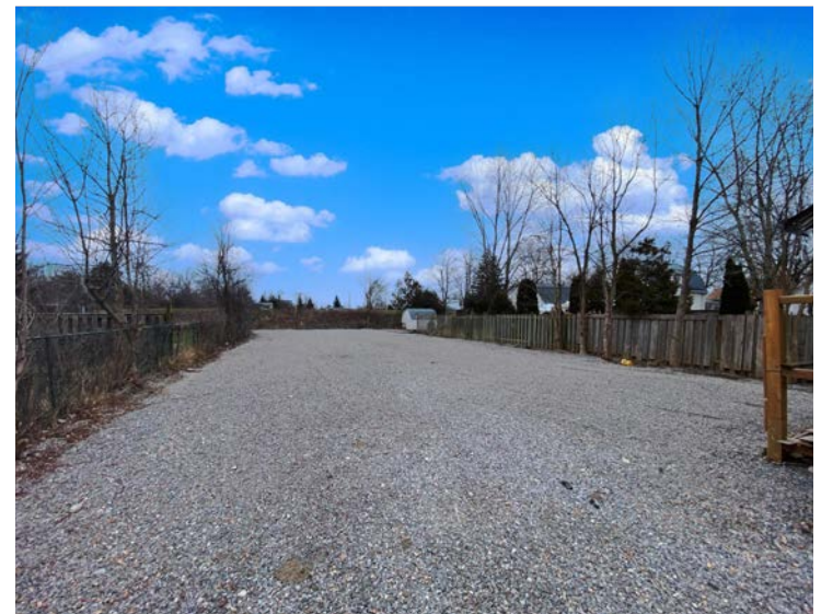
Fenced Gravel Back Yard