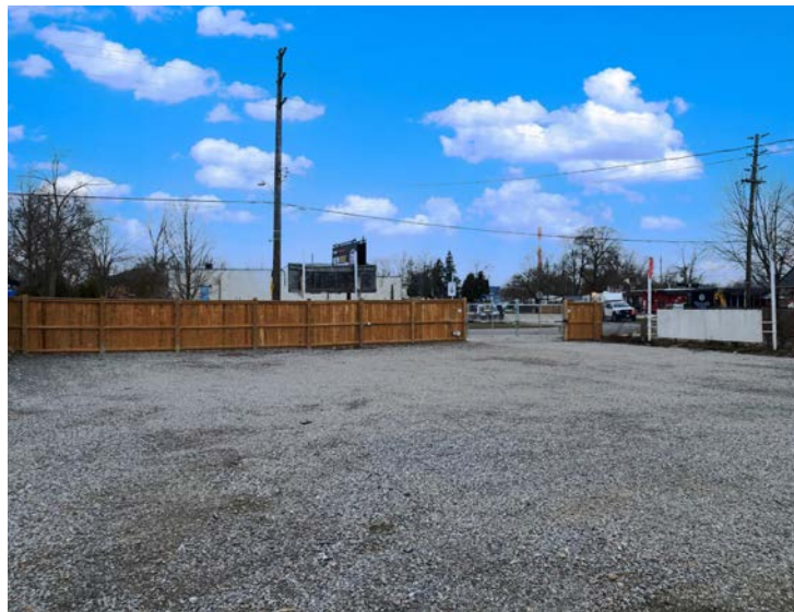
Fenced Gravel Front Yard