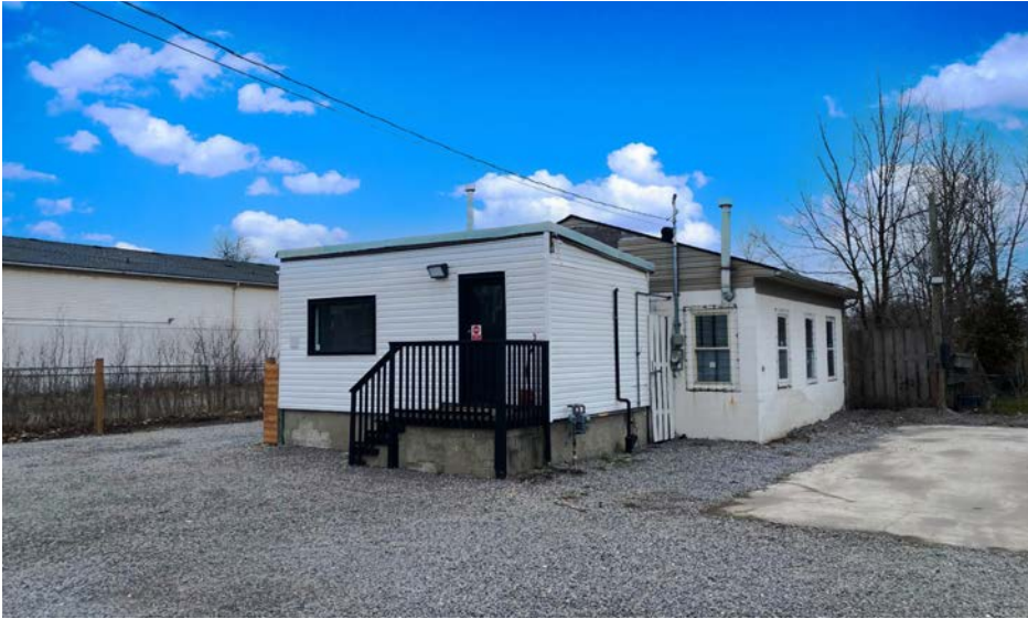
275 SF Office