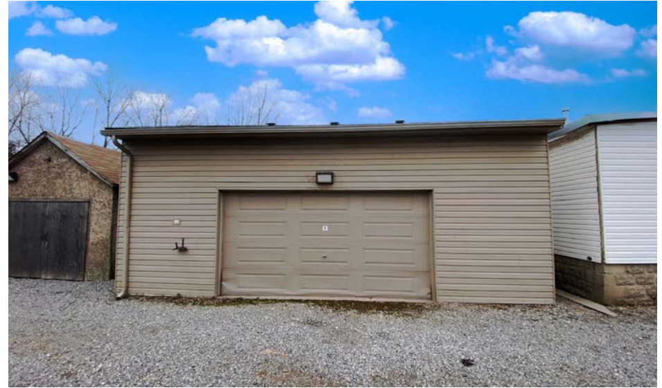
820 SF Shop/Warehouse