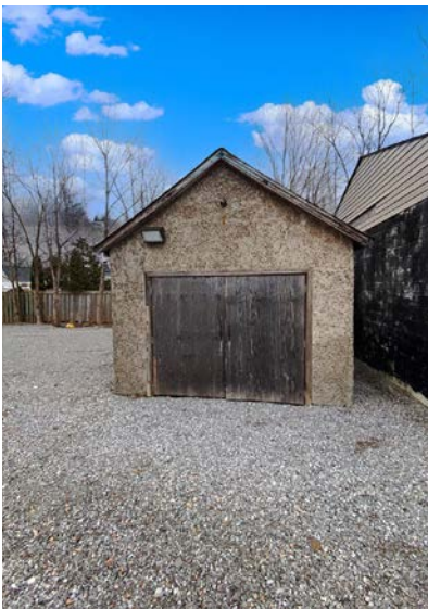
270 SF Storage Shed